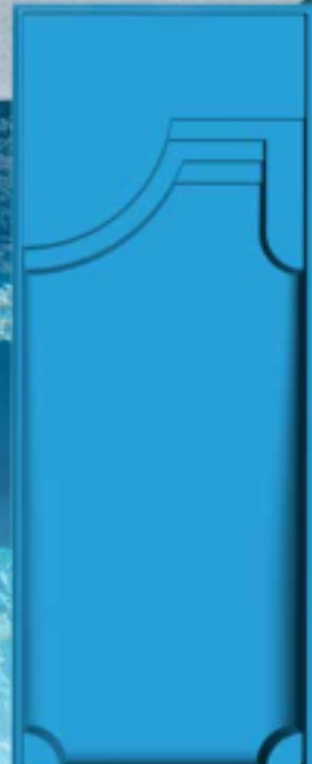
Great Lakes Beach

Width: 16'2" / 4.93 M Length: 37' / 11.34 M Depth: 3'8" - 6'4" / .97 M - 1.93 M Area: 540 ft 2 / 54 M 2 Volume: 14,500 G / 55,000 L