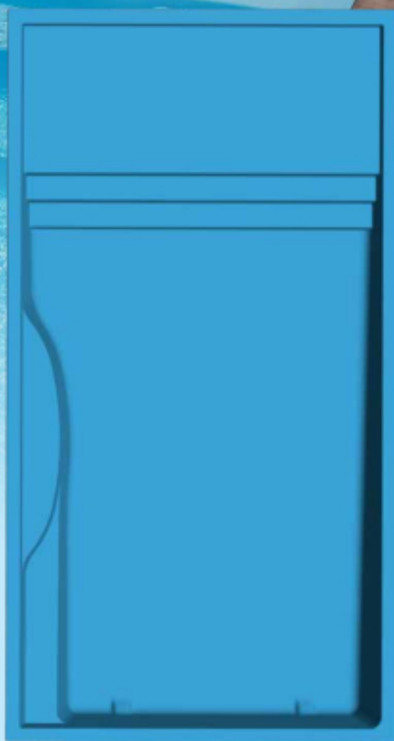
Wylela Beach Grande

Width: 12' / 3.66 M Length: 30' / 9.05 M Depth: 3'6" - 6' / 1.07 M - 1.83 M Area: 360 ft 2 / 34 M 2 Volume: 7,271 G / 32,176 L